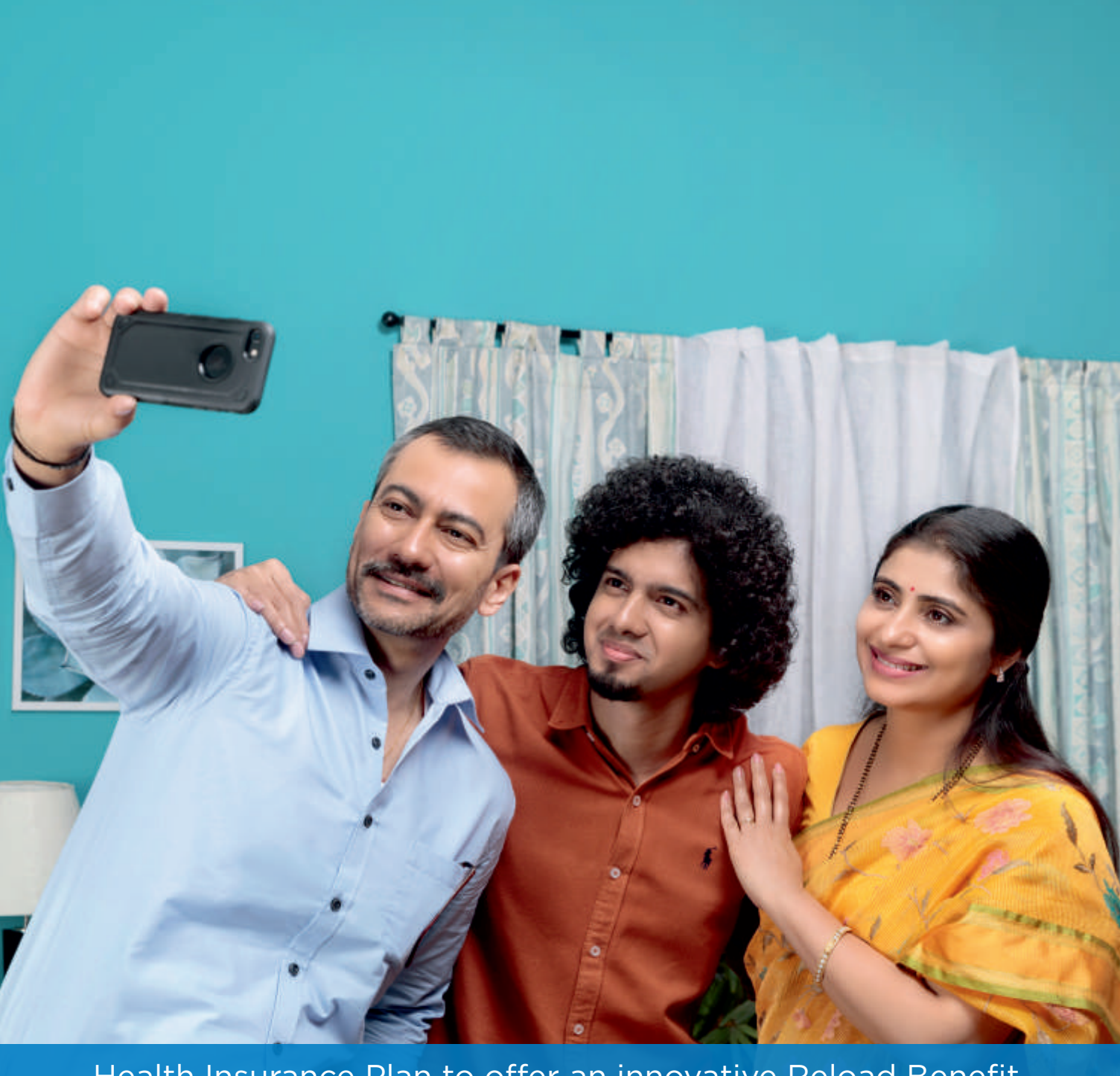
Health Insurance Plan to offer an innovative Reload Benefit